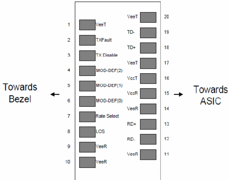
Figure 1. Diagram of host board connector block pin numbers and names